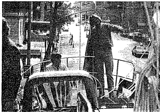
STAR and director of the film, Michael Douglas coordinates action aboard Angelina, a Mason 43. The film's producers rented the boat from a City Island yacht brokerage.