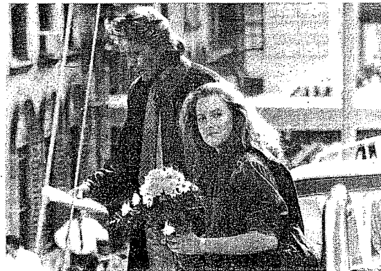
ON DECK — Michael Douglas and Kathleen Turner, hero and heroine in the film, "Romancing the Stone," take a break from the New York City filming, shot in October last year.